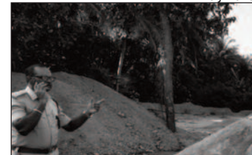
A police officer at the site.

of sand weighing 780 tonnes. The approximate cost of seized sand is Rs 5,00,000.