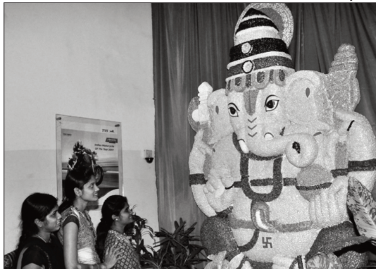
Public viewing the 'Dhaanya Ganesh' idol.

Ten kilograms of white flat beans, three kg sesame seeds, cow peas, sago, and gum made by using Maida have been used to make this idol.