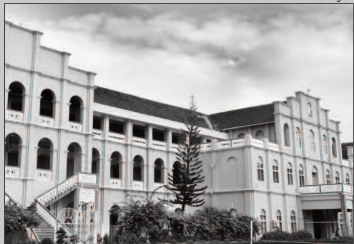
SAC Swachh Campus