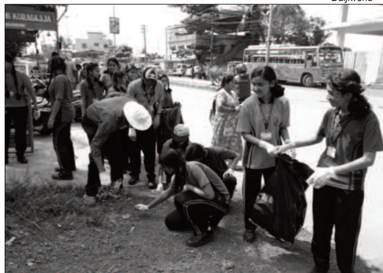
MCCS students cleaning the campus after Gandhi Jayanthi celebrations.

The highlight of the programme was a meaningful Hindi dance drama depicting the life of great Mahatma followed by a lively dance setting the tone for the joyous 150th birth anniversary celebration of