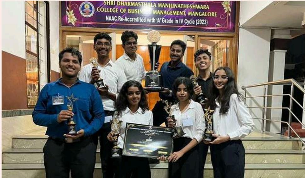
Genesis SDM college Mangaluru National level fest