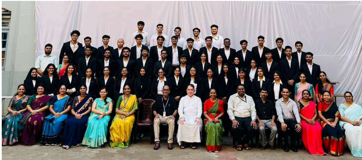
III YEAR BATCH -D