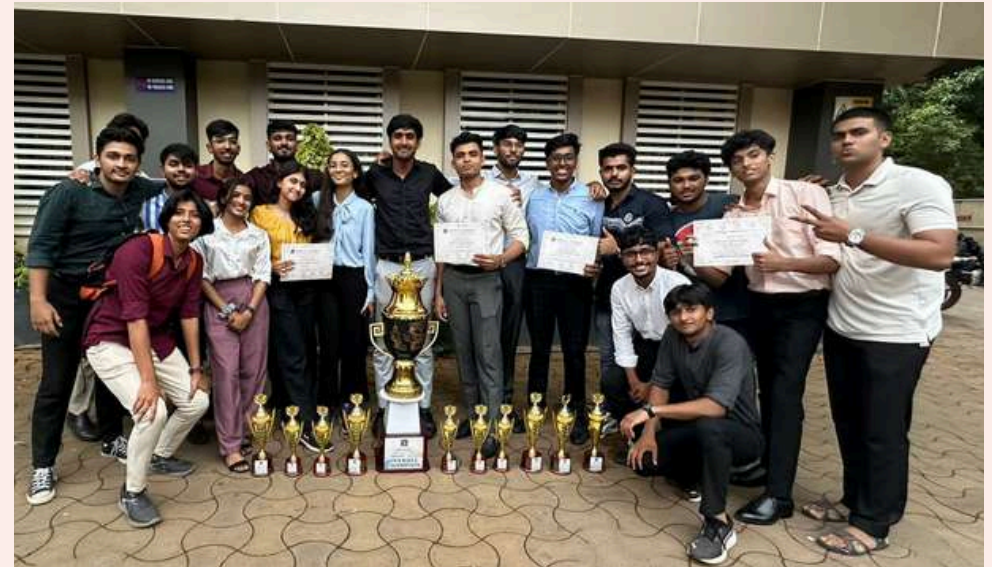
Magma 24 SRINIVAS UNIVERSITY National level fest