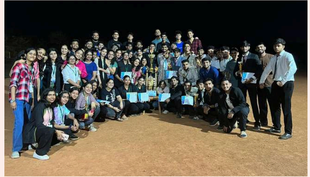
Nirvana 23 St Joseph's College National level fest