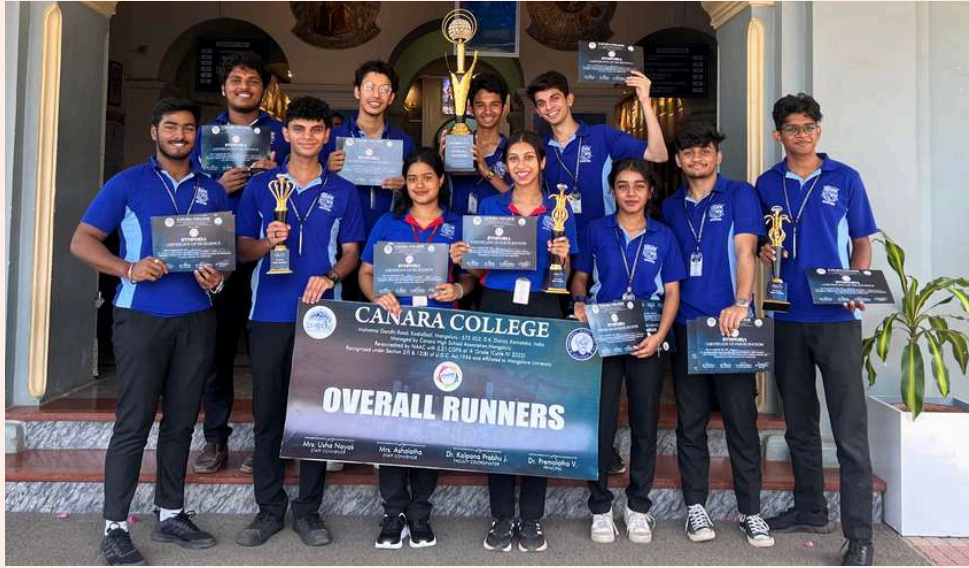
Symposia Canara college National level fest