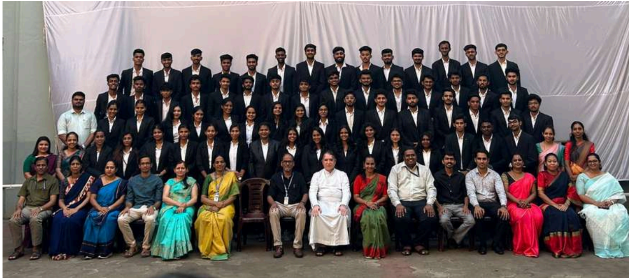
III YEAR BATCH-A