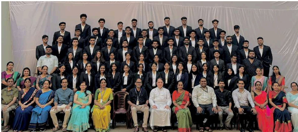
III YEAR BATCH -B